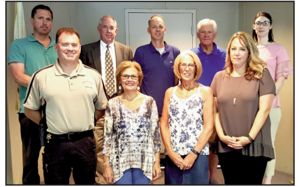
Foundation Executive Board 2019-2020

I am happy to report that it has been another productive year for the OCC Foundation, thanks to our generous contributors. As shown on the second page of this Annual Report, the Foundation funded requests from several different departments. Among the wide variety of items funded were workstations and stools for the Cosmetology Department, teaching microscopes for the Life Science/Biology/Anatomy Departments, updated instructional equipment for the Automotive Service Technology Department, and various items to assist the Adult Education and Single Parent Education programs. Instructors and students are always very appreciative of our assistance and often take the time to demonstrate pieces of equipment to Foundation board members. Total funding made available to the college was over $147,000, which was in excess of a 30 percent increase over last year. Obviously, this would not be possible without the support of many community members, alumni, and friends of the college. Together, we are making impacts that the students can, literally, lay their hands on every day.