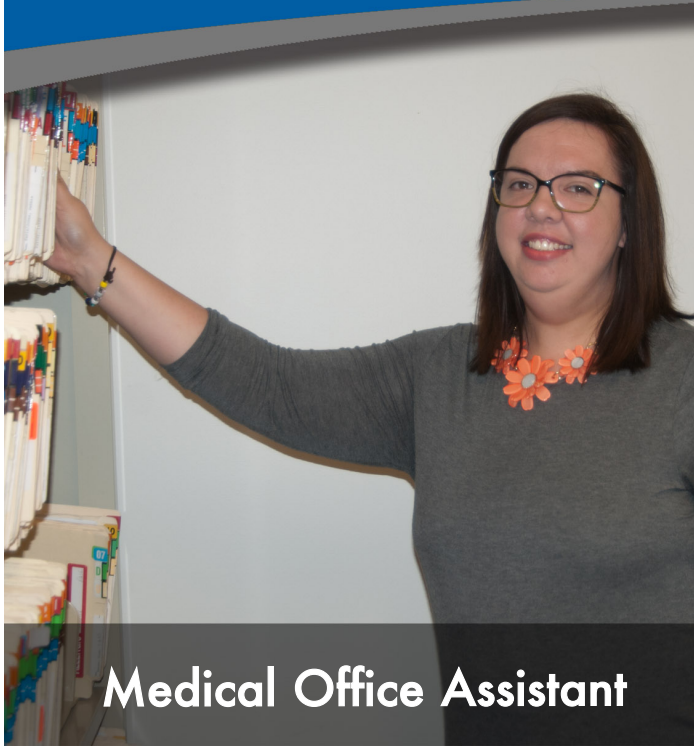
Medical Office Assistant

The Medical Office Assistant degree program is designed to prepare medical office assistants, medical transcriptionists, medical receptionists, and other related personnel to meet the needs of area and national medical offices. In this area, jobs are available in hospitals, clinics, doctors' offices, insurance companies, health foundations, local industries, and governmental agencies. The demand for well-trained medical office assistants is increasing due to the expansion of medical services, medical agencies, and the increase of required medical records maintenance. This degree is available online.