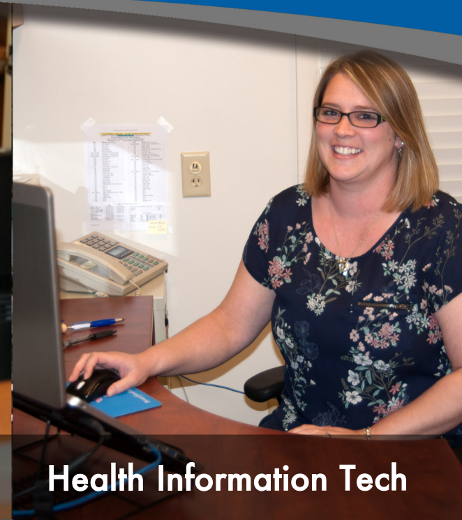
Health Information Tech

Delivering quality healthcare depends on capturing accurate and timely medical data; medical coding professionals fulfill this need as key players in the healthcare workplace. The Medical Coding Associate certificate program prepares students for the Certificate Coding Associate exam/certification ( www.ahima.org/certification/cca.aspx ). Health information coding is the transformation of verbal descriptions of diseases, injuries, and procedures into numeric or alphanumeric designations. The coding of health-related data permits access to medical records by diagnoses and procedures for use in clinical care, research, and education. Medical coders assign a code to each diagnosis and procedure by using classification systems software. Successful completion of course prerequisites is required prior to enrollment into this program.