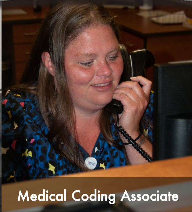
Medical Coding Associate

The Medical Office Assistant degree program is designed to prepare medical office assistants, medical transcriptionists, medical receptionists, and other related personnel to meet the needs of area and national medical offices. In this area, jobs are available in hospitals, clinics, doctors' offices, insurance companies, health foundations, local industries, and governmental agencies. The demand for well-trained medical office assistants is increasing due to the expansion of medical services, medical agencies, and the increase of required medical records maintenance. This degree is available online.